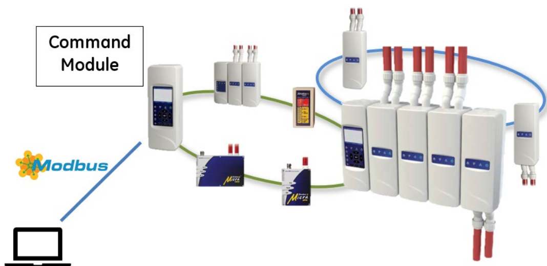
Figure 1: Connection overview

Communications are maintained via Modbus TCP using a ModuLaser command display module.